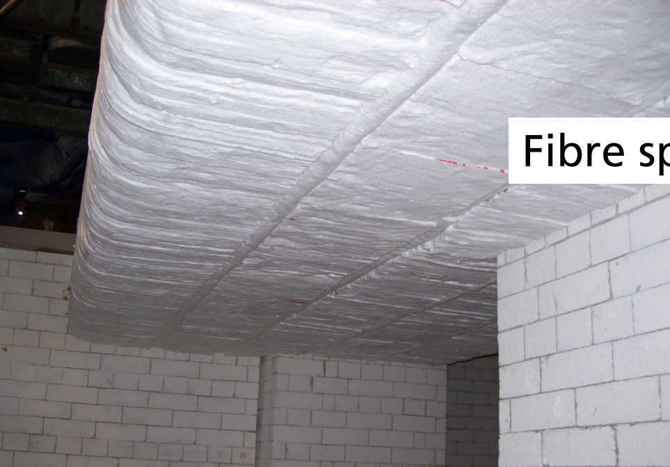
MAS® Module Lining

From the range of standard product forms, custom-made, specialties are being manufactured in our own production facilities.