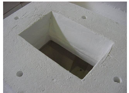
Vacuum formed peepholes

For more detailed information about these products, please do not hesitate to contact one of our specialists.