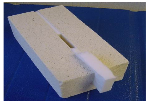
Fibercon Expandable felt (up to 3 x expansion after heating up )